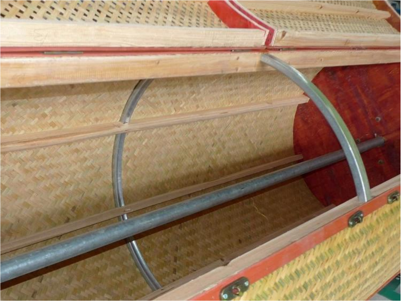
Steel tube and steel ring reinforcement design, the machine runs smoothly, and the body vibration is small.