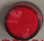
电源指示灯 Power LED