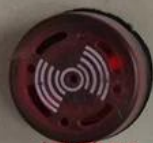
报警器 Alarm LED