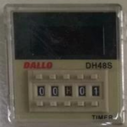
计时器 Time Control