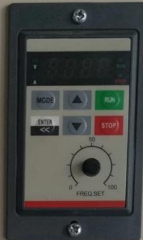
调速器 Speed Control